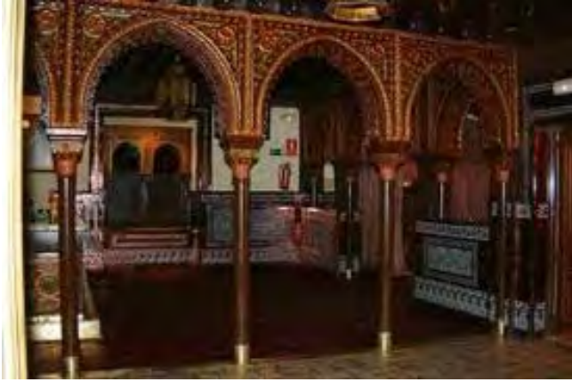
Discotheque Villa Rosa.

De la mano de Lorca y un monumento en su memoria, llegamos a la Plaza Santa Ana, otro lugar de encuentro para primera hora de la noche, donde los madrileños se reúnen a tomar unas tapas, cañas y chatos de vino (vaso). En una de sus esquinas se ubica una discoteca, Villa Rosa, donde se filmó parte de la película de Almodóvar, Tacones Lejanos.