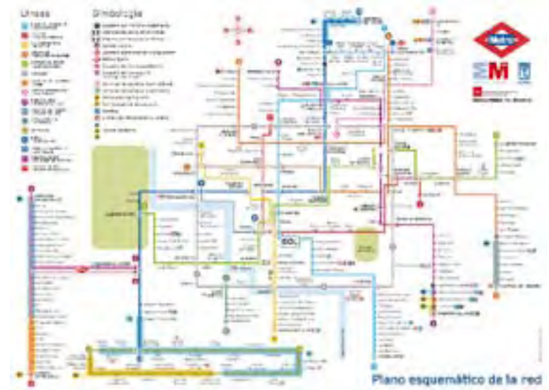
Plano del metro de Madrid

Hay taxis toda la noche y un servicio de autobuses nocturnos a los que se les llama Buhos.