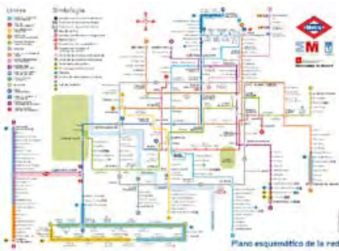
Plano del metro de Madrid

Although Madrid is one of the safest places in Europe, it is recommended that everyone be careful. Always be aware of where purses and hanging bags are located especially in places where there are crowds. Unfortunately in Madrid, as in most cities, there are many petty thieves.