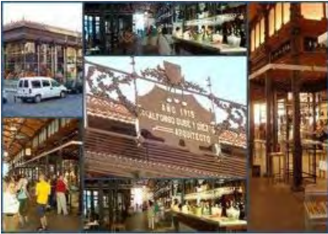
Mercado de San Miguel

are great admirers of their city's nightlife and the many pleasures it offers. The food, the wine, the numerous and varied shows and places will not leave anyone unsatisfied.