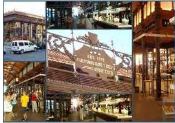
Mercado de San Miguel

Todos nosotros os estamos esperando con mucha ilusión y con ganas de que esta experiencia madrileña os resulte inolvidable