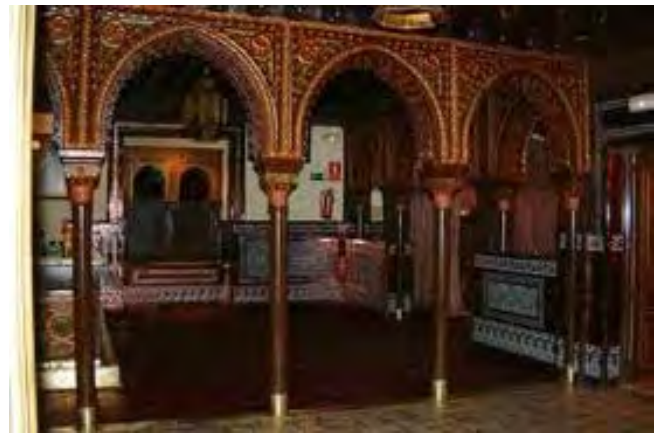
Discotheque Villa Rosa